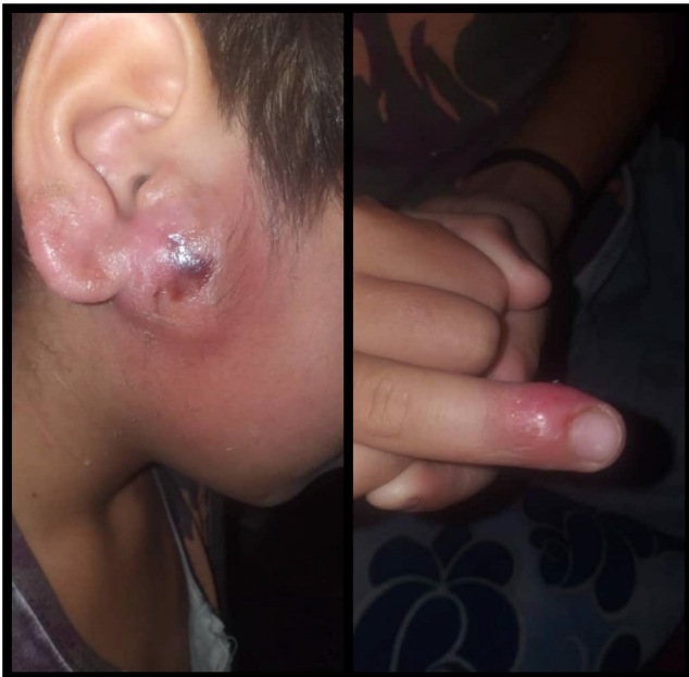
FIGURE 2 Deep cutaneous ulcers (left picture) and paronychia (right picture) in a 3-year-old boy with neutropenia.

infection because of mutations in STAT3 , DOCK8 , ZNF341 , PGM3 , IL6ST , IL6R , and CARD11 . 17