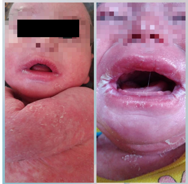
FIGURE 3 Generalized exfoliative dermatitis in a 5-month-old boy with Omenn syndrome.

However, most skin manifestations are not pathognomonic for a specific immunodeficiency and can be detected even in immunocompetent population. Hence the regular follow-up, and close monitor for other non-dermatological manifestations such as failure to thrive, chronic diarrhea, and demographic data such as consanguinity or family history suggestive of immunodeficiency, may be helpful to define the nature of the disease.